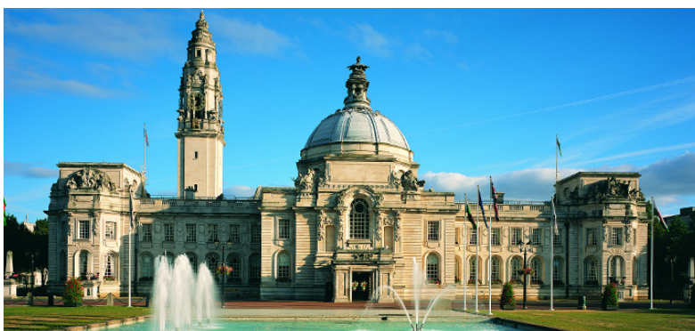
City Hall Cardiff

Following lectures delegates are invited to a Drinks Reception and Poster Session in the Lower Hall, giving you the opportunity to view the posters, talk to the authors, and circulate amongst the trade exhibitors. There is no need to book for this event as it is included in your registration fee.