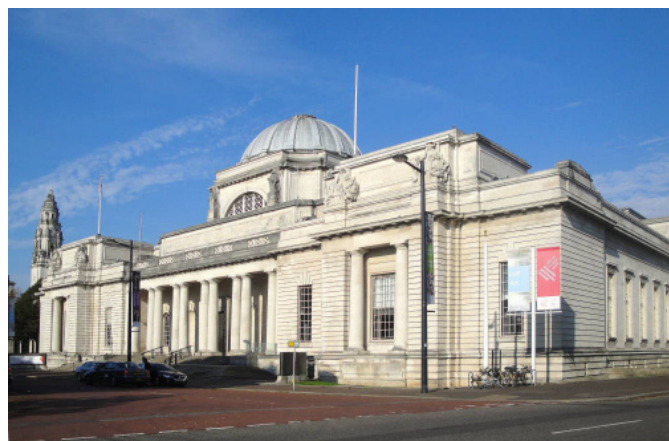
National Cardiff Museum

Numbers are limited so please make sure you book early to avoid disappointment.