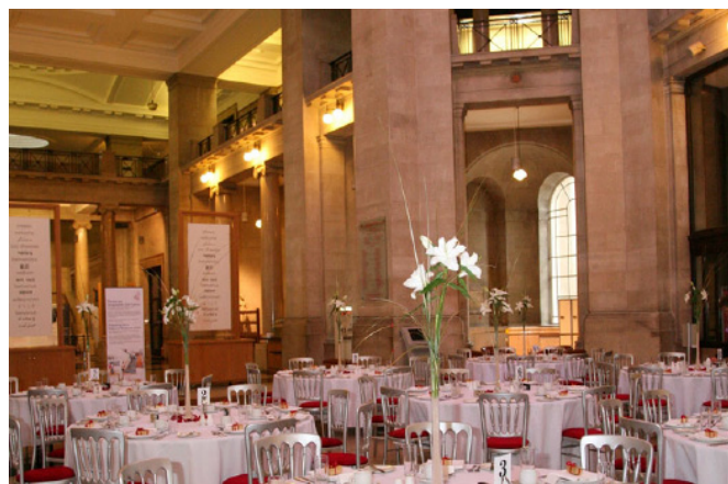
The Grand Hall at the National Cardiff Museum